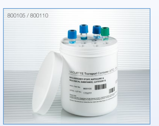
Dimensions: 112 x 130 mm (diameter x height)