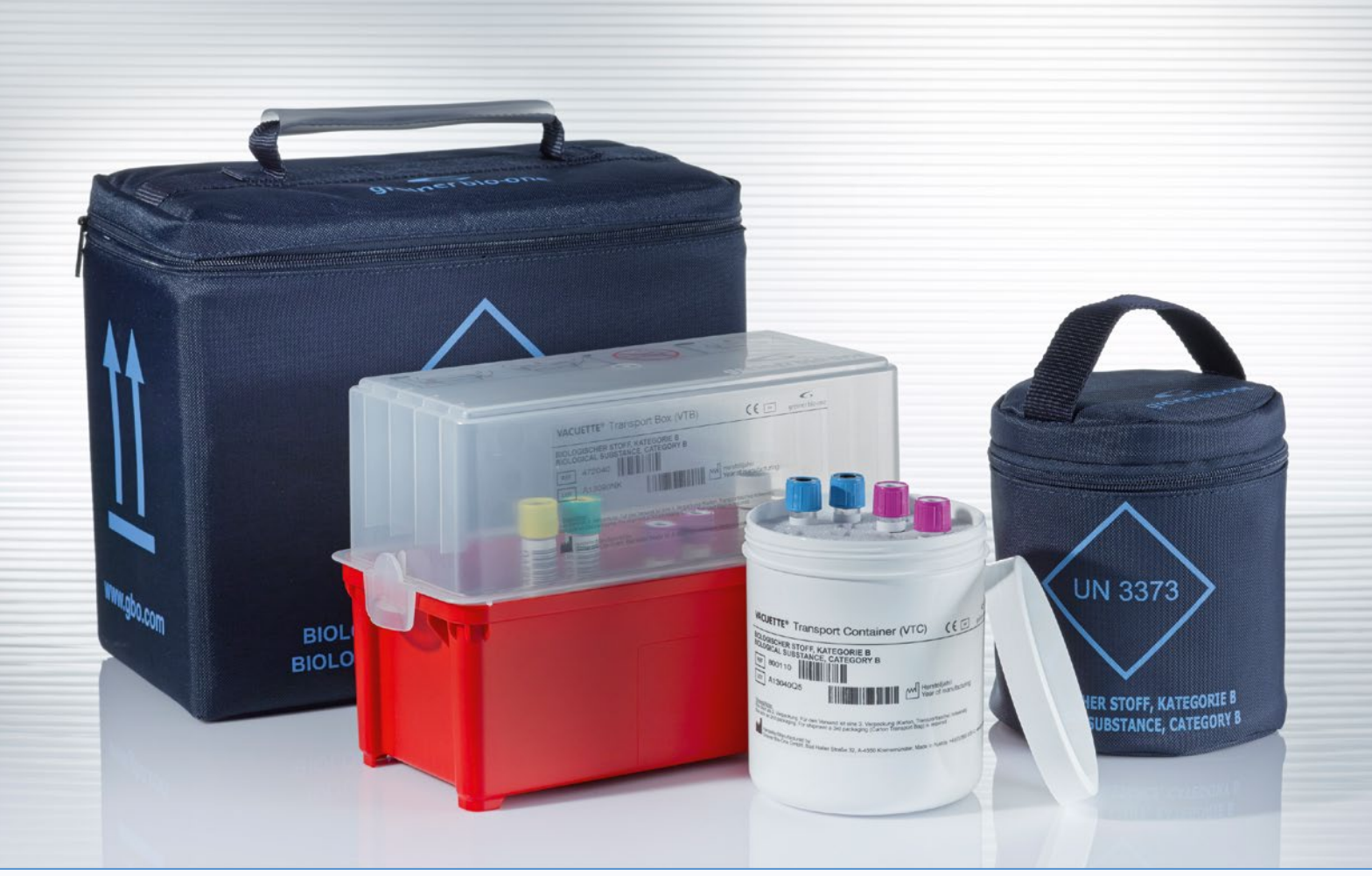
VACUETTE® Transport Line