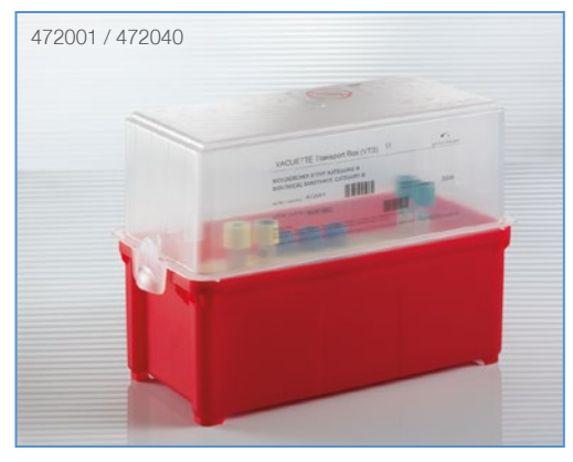
Dimensions: 270 x 125 x 180mm (length x width x height)